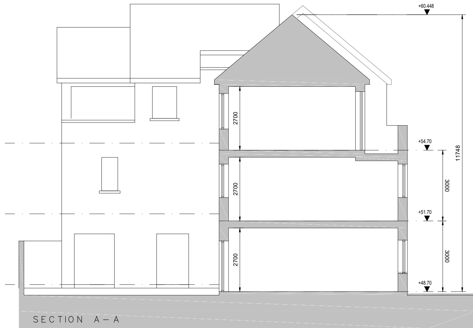
SECTION A - A